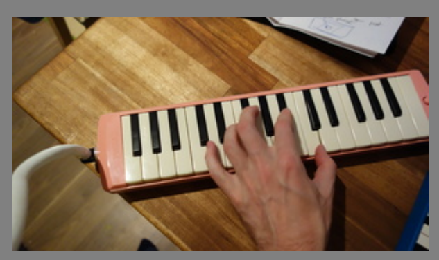
Player 1 & 2: transcribe player 1's looped phrase (while continuing to play your own phrase)