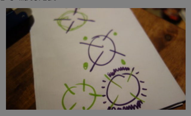
Player 1 & 2: repeat the last 4 steps until a) one player wins b) the piece destroys itself