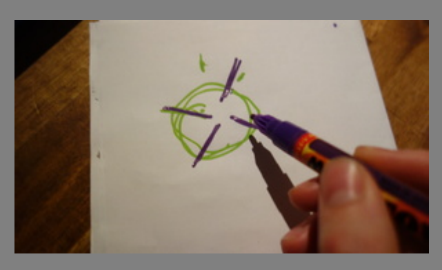
Player 1: begin playing a new looped phrase which will re-contextualise player 2's material