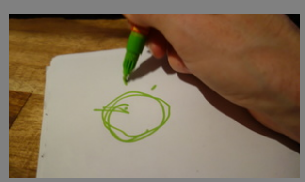
Player 2: begin playing a looped phrase which will re-contextualise player 1's material